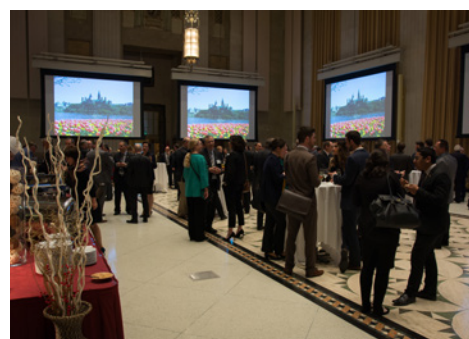
The McDonald Room.