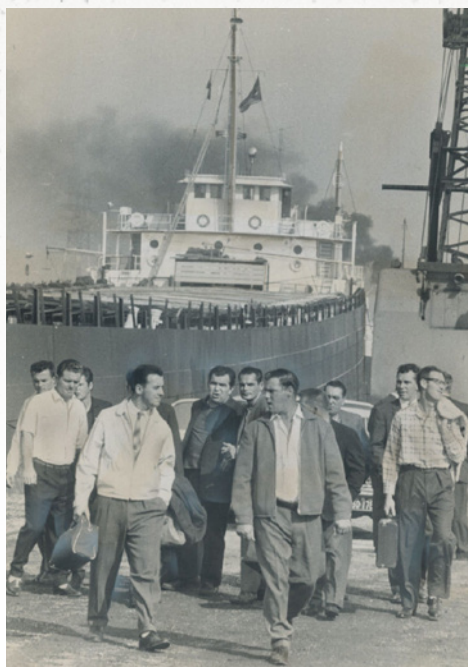
Labour leader Hal Banks leading longshoremen off a vessel in the Great Lakes Region.