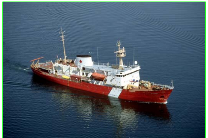
CCGS Hudson is a large offshore vessel approximately 80 metres long that is multi-taskable to fishery and oceanographic missions, as well as geological and hydrographic surveys. The vessel is equipped with wet labs, trawl capability, bottom sampling capability and water column sampling capability, and can accommodate up to 26 scientists.