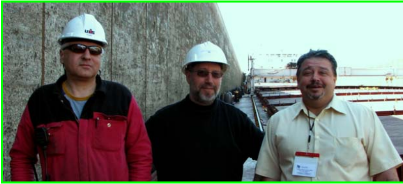
Greetings from the M.V. Quebecois